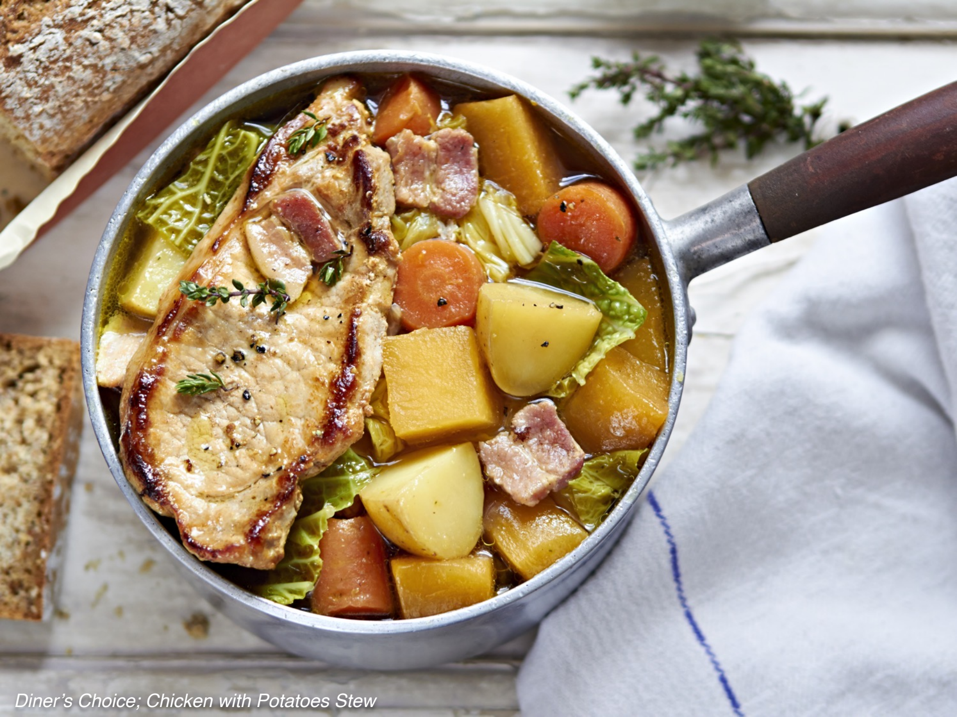
Diner's Choice; Chicken with Potatoes Stew