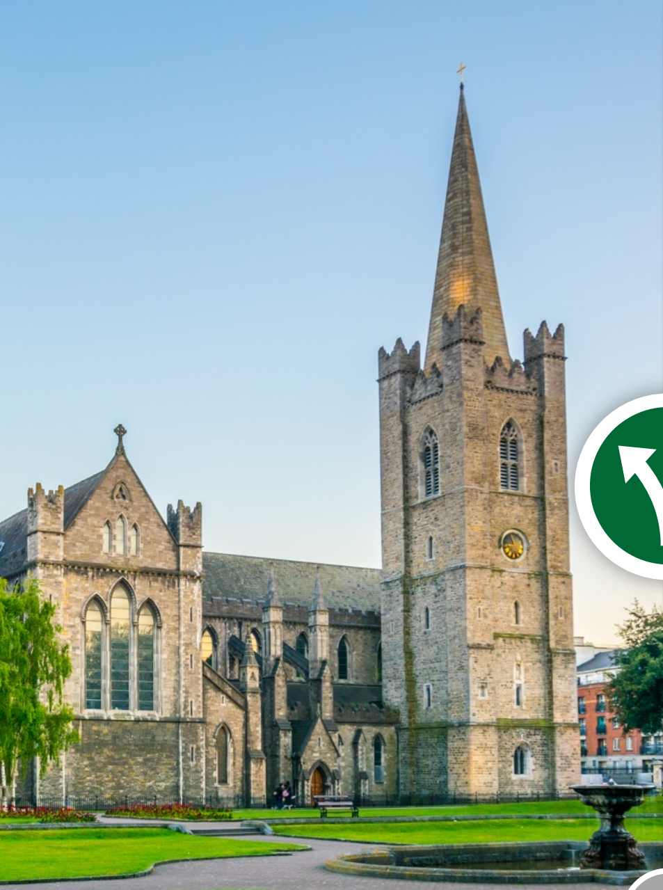
Dublin by Coach