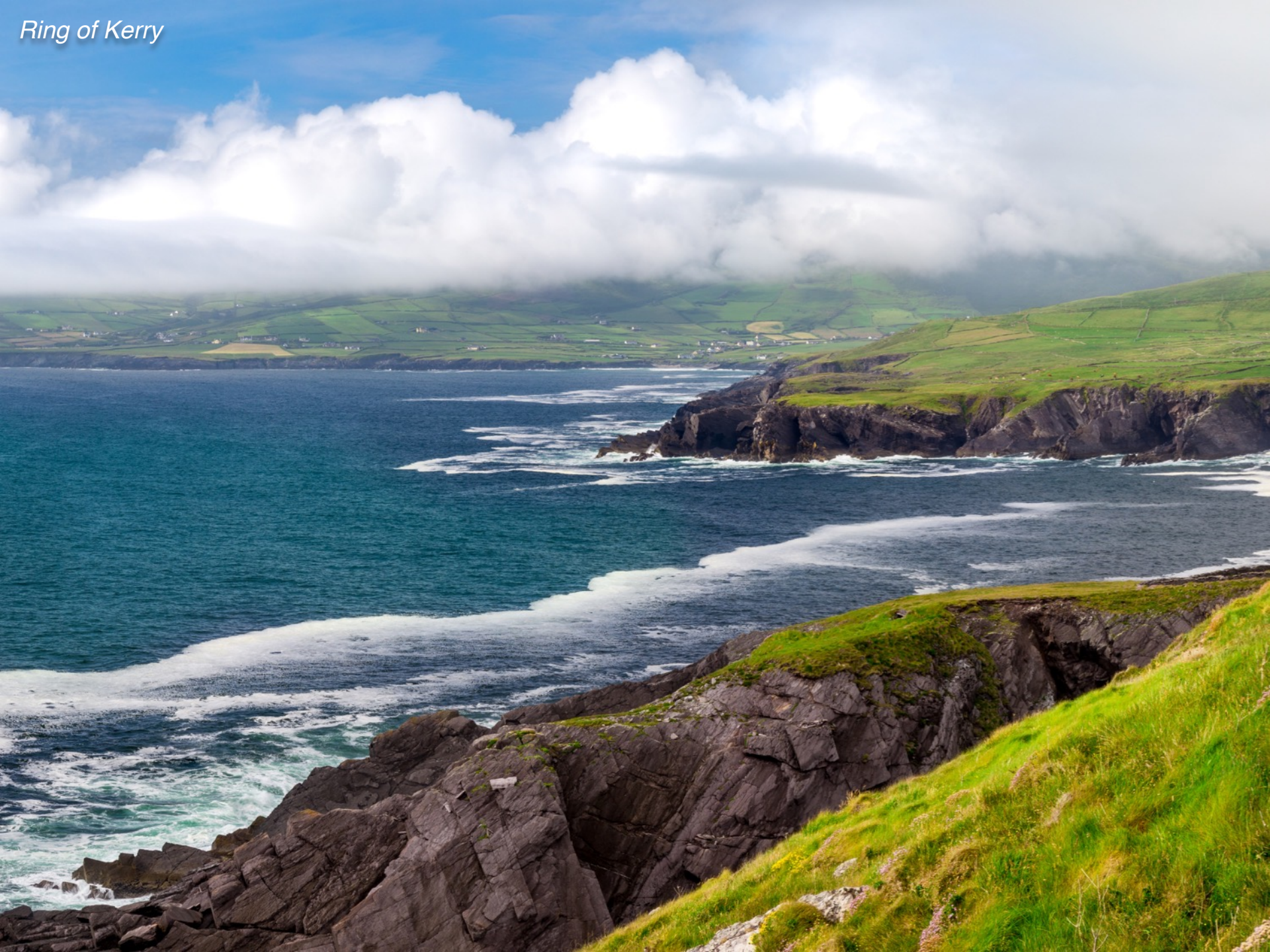
Ring of Kerry