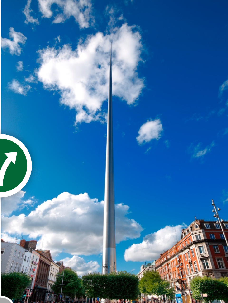
Walking Tour of Dublin